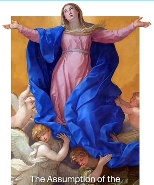
The Assumption of the Blessed Virgin Mary