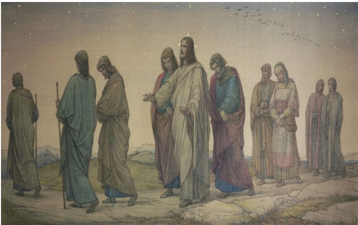
View this bulletin online at www.DiscoverMass.com