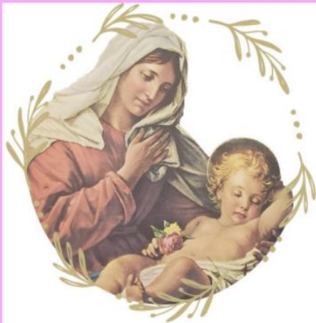
Her children rise up and call her blessed Proverbs 31:28

Memorial envelopes are available in the rear of the church. If you want your mother's name to appear in the special MOTHER'S DAY REMEMBRANCE in the bulletin, you must return your donation envelope in the regular collection or to the rectory office by MONDAY, MAY 1 ST (Suggested donation - 10.00 per mass.)